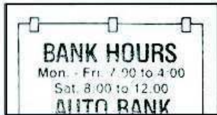
A. Use 1"-2" (2.5-5cm) strips of masking tape to position marking in proper registry.