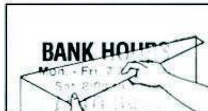
D. Remove premask at 180° (pull back on itself)